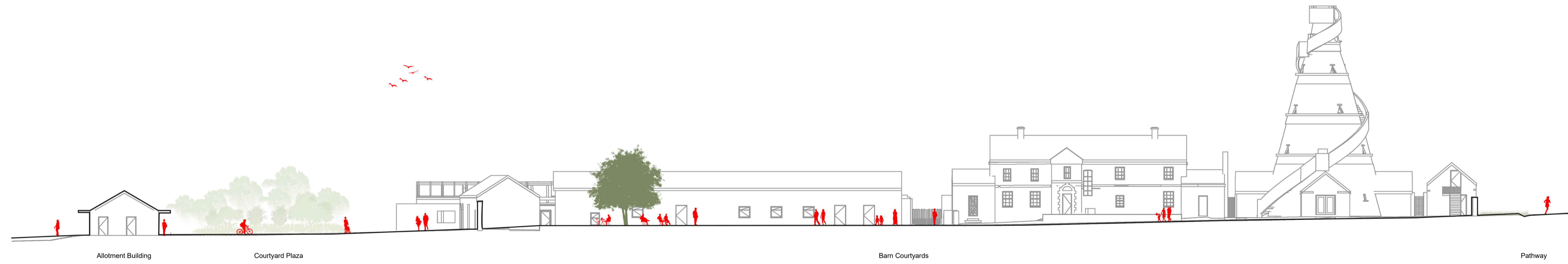
Wonderful Barn - Section DD